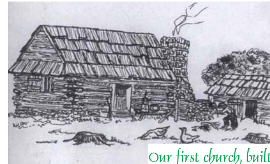
Our first church, built in 1802

... from everlasting to everlasting, the Lord's love is with those who fear him, and his righteousness with their children's children. -- Psalm 103:17